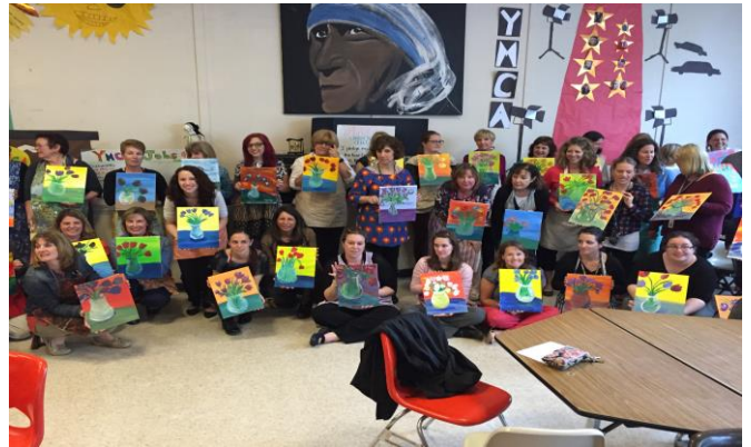
Teacher Appreciation Week was celebrated during May. Teachers were treated to an afternoon of painting.